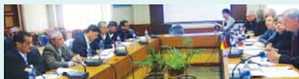
Finance Secretary and his team with German Delegates