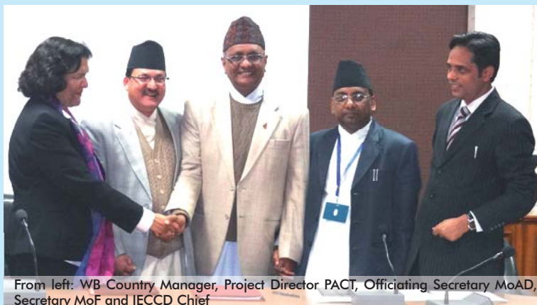
From left: WB Country Manager, Project Director PACT, Officiating Secretary MoAD, Secretary MoF and IECCD Chief

The objective of the project is to improve the competitiveness of smallholder farmers and the agribusiness sector in selected commodity value chains in the project district by (i) helping farmers groups and cooperatives engage in profitable market oriented production and improved access to markets (ii) creating and strengthening industry-wise partnership along the value chain and (iii) reducing existing obstacles to agriculture and food trade. This additional financing removes the restriction of 25 districts, and now the project will be implemented throughout all 75 districts. So that the project would have