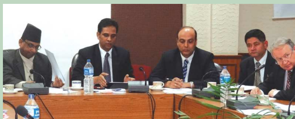
From left: Finance Secretary, IECCD Chief, Under Secretary IECCD and DP Officials

expressed their satisfaction over the progress achieved so far. DPs raised some queries about the overall effectiveness of the performance including decreasing capital expenditure and other contemporary issues and provided some important suggestions to GON for the effective implementation of their suggestions regarding overall portfolio management in Nepal.