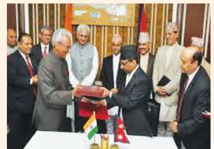
Finance Secretary Mr. Shanta Raj Subedi and Indian Ambassador to Nepal Mr. Jayant Prasad after signing the Agreement in the presence of Rt. Hon. Chairman of Interim Government, Hon. Finance Minister, Hon. Indian External Affairs Minister and other officials

The Government of India has agreed to provide 764 vehicles to Nepal for the purpose of the upcoming Constituent Assembly (CA) election. Two different agreements to provide the vehicles were signed at the Office of Prime Minister and Council of Ministers in the presence of Rt. Hon. Khil Raj Regmi, Chairman, Interim Government and Hon. Indian Minister of External Affairs Mr. Salman Khurshid on July 09, 2013.