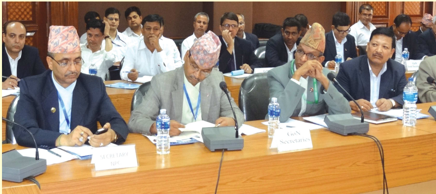
GoN Secretaries and Officials

for mutual accountability, where capacity of both the Government and donors can be evaluated.