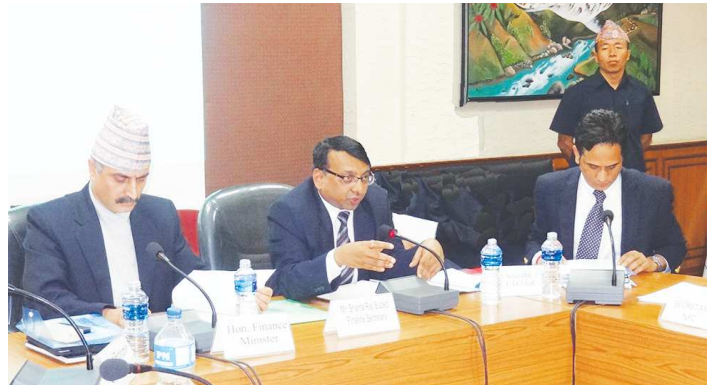
Hon. Finance Minister, Finance Secretary and IECCD Chief