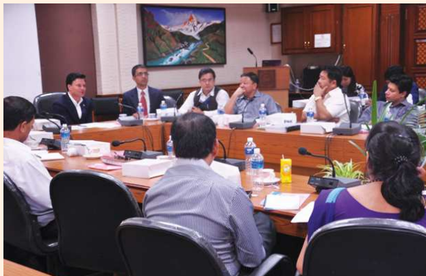
GEF stakeholders participating in discussion during the workshop on biodiversity

Two different workshops related to Global Environment Facility (GEF) activities in Nepal were organized by IECCD, Ministry of Finance, under GEF Operation Focal Point Support Program. The first workshop entitled “GEF Stakeholders’ Workshop on Biodiversity” was held on August 8, 20103 and the second entitled “GEF Workshop on Land Degradation and POPs and Chemical” was held on 26 August, 2013.