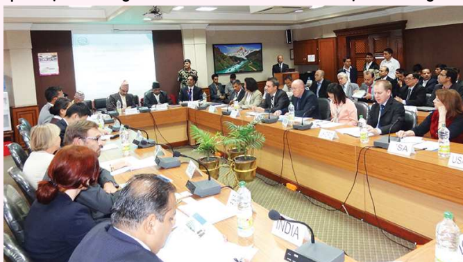
Local Donors Meeting Floor

LDM is a permanent institutional mechanism for donor coordination, which normally takes place in the interval of three to four months. This is the second meeting after the current Finance Minister assumed his Office. LDM is taken as an effective forum for regular interaction and dialogue between the Government and its Development Partners. Altogether 88 participants, including Hon. Vice Chairman of the National Planning Commission, Chief Economic Advisor, Ambassadors from Denmark, Switzerland and Finland, Heads of the Missions, high level representatives from DPs, Nepal Rastra Bank, Financial Comptroller General's Office and the Ministry of Finance were present in the meeting.