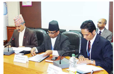
From Left: Hon. Finance Minister, Finance Secretary, and IECCD Chief