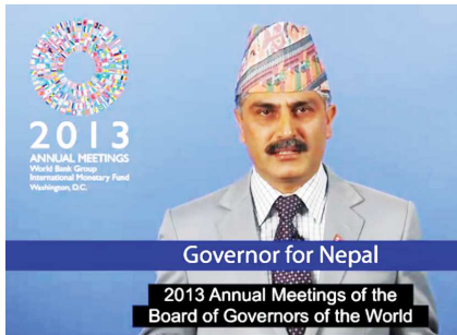
Statement by Hon. Finance Minister and Governor of the World Bank Group for Nepal

World Bank Group has been an important partner to all its member countries to support the poor, boost growth and leverage the private sector. He urged the Bank Group to channel its support taking into account the country context. He also welcomed the World Bank Group's growing interest to support for Nepal's hydropower development. He encouraged the World Bank Group to lead investment on regional level projects as well, especially in the area of hydropower, irrigation, renewable energy and climate change.