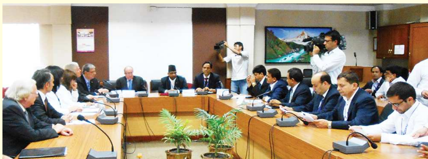
A glimpse of signing ceremony

The first phase of LGCDP was completed in July 2013. Considering the importance of the Program, the Government of Nepal has decided to implement the second phase of LGCDP under the joint funding approach. The Program is aligned with the national development plan of Nepal which includes poverty reduction, inclusive growth, social transformation, sustainable peace and good governance as its major objectives along with an emphasis on devolution, social inclusion and meeting peoples' demands at the local level.