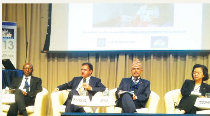
From left: Governors of Ethiopia, Afghanistan, Nepal, and Indonesia

This event was an opportunity to showcase what the countries are doing across multiple sectors to advance maternal and child health outcomes, including improving nutrition and family planning services. The conversation was very fruitful that provided an opportunity to align and promote coordinated advocacy and action around country and development partner commitments made at three landmark global summits in the past: the 2012 Child Survival Call to Action, which launched A Promise Renewed, the 2012 London Summit on Family Planning, which led to the FP2020