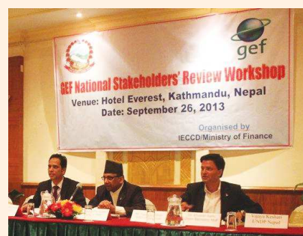
From left: IECCD Chief, Finance Secretary, and IECCD Under Secretary