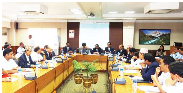
ADB third QCPRM Meeting Floor